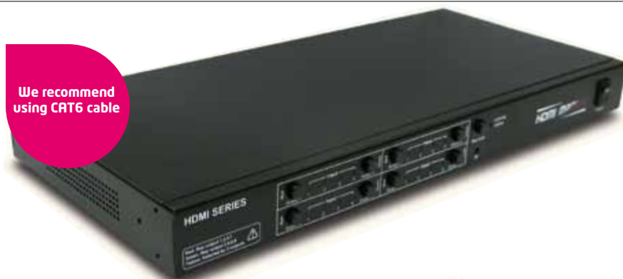
SY1000 Matrix Switcher Front