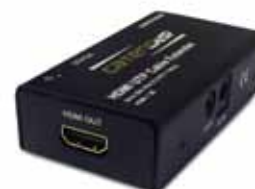
SY1000 HDMI Receiver